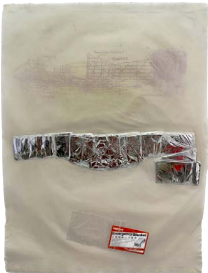
Nazanin Noroozi False Dawn 0024, 2025 Pulp screen print and thermal emergency blanket embedded in handmade abaca paper