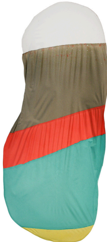
Fabienne Lasserre Are (White, Brown, Red, Aqua, Yellow) , 2013 Pigmented linen paper and cotton tubing