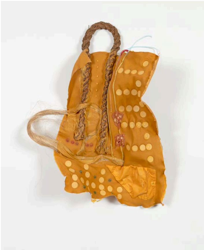
Crystal Z. Campbell Pagkupkop , 2025 Abaca, manila envelope, manila rope, capiz shells, and other mixed-materials