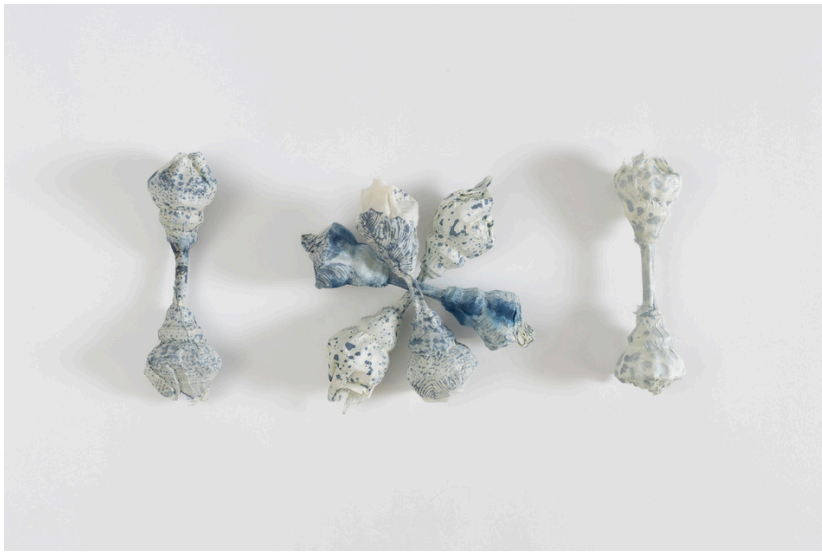
Tatiana Ginsberg Vajra/Doorknobs (Indigo) , 2019 Kozo paper, indigo