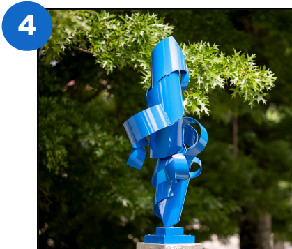
4 Richard Pitts (PA) True Blue, 2024 Powder coated aluminum