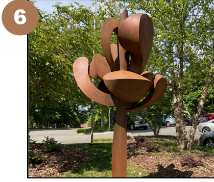
6 David Boyajian (CT) Unfurling with Seeds, 2015 Steel sculpture