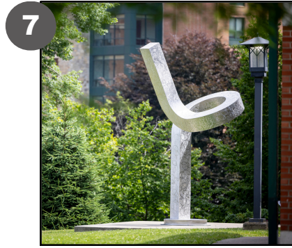
7 Benjamin Pierce (MO) Skyward, 2016 Stainless steel