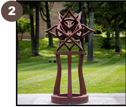
2 Beau Lyday (NC) Red Astral Planes, 2024 Aged painted tin and wood