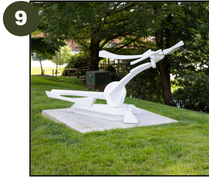
9 Andrew Light (KY) The Ecstatic, 2023 Steel