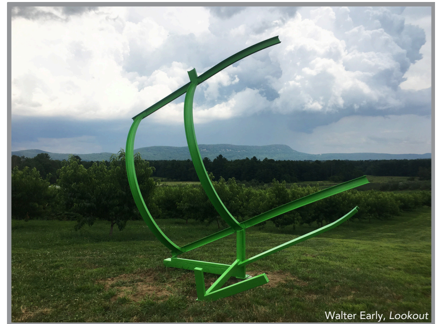
Walter Early, Lookout