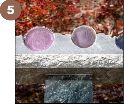
5 Glenn Zweygardt (NY) Verde Trilogy, 2023 Verde antique, granite, cast bronze and cast glass