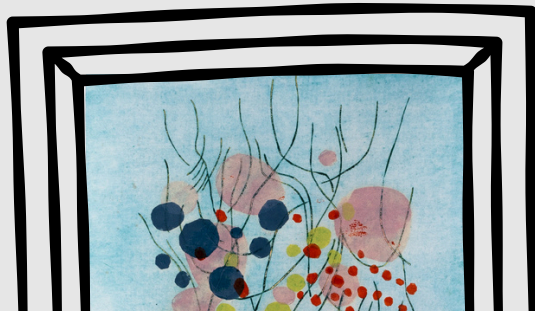
Durr, B. 883 K 1970's