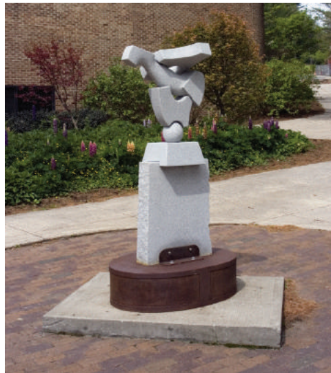
19th Rosen Sculpture Competition (2005 - 2006) Armor Granite and steel