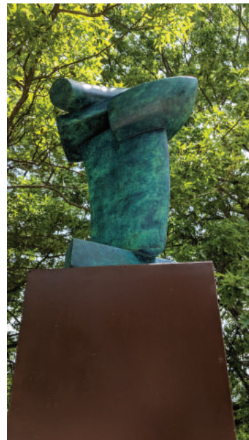
33rd Rosen Sculpture Competition (2019 - 2020) Child's Play Revisited Cast bronze, steel