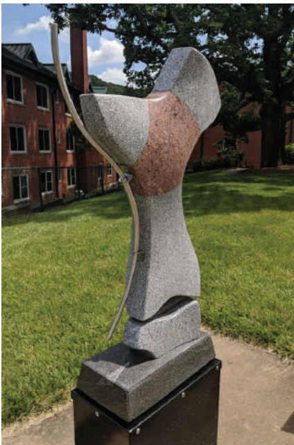
32nd Rosen Sculpture Competition (2018 - 2019) Column A, Column B, Column You, Column Me