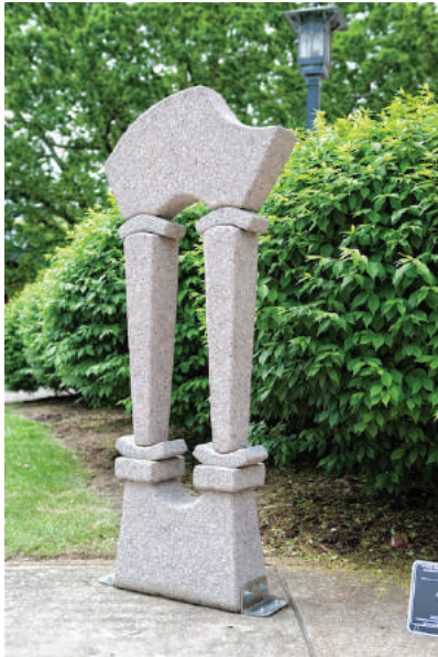
23rd Rosen Sculpture Competition (2009 - 2010) Mahogany View Granite