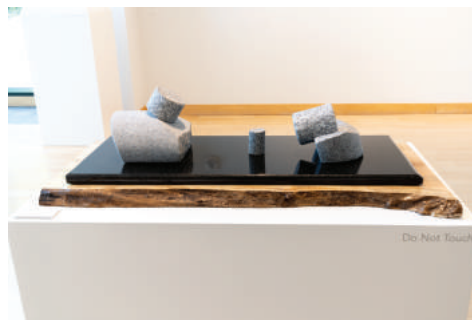
Shawn Morin Sex, lies, and depression , 2021 Granite and wood