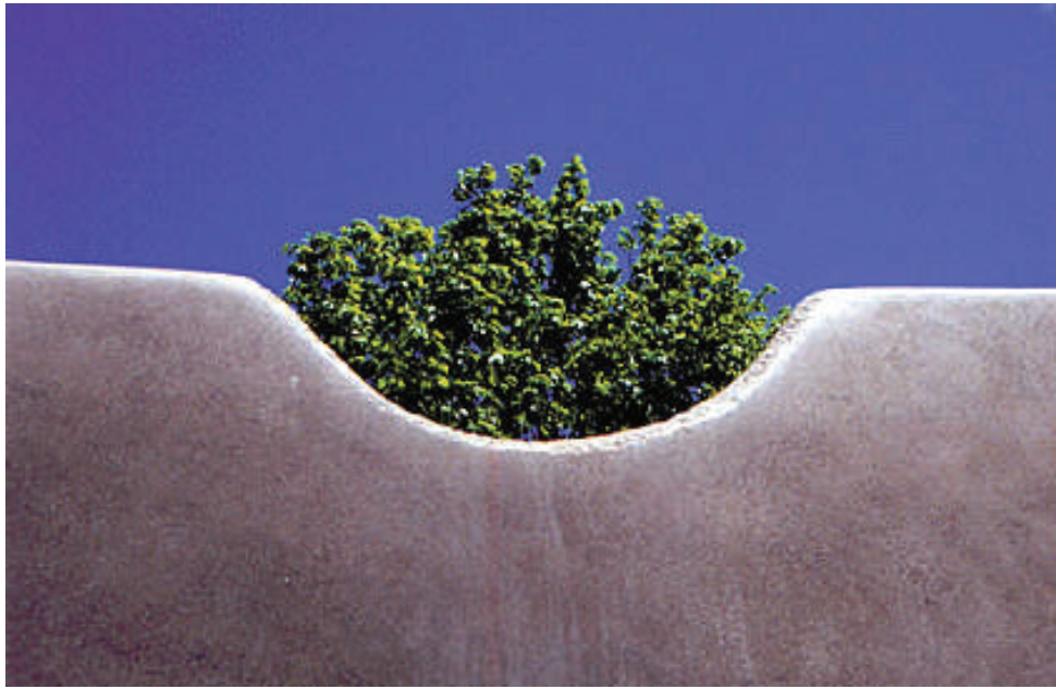
13th Rosen Sculpture Competition (1999 - 2000) Gethsemane Limestone (Detail)