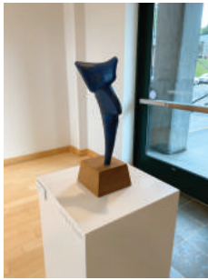
Shawn Morin Alone , 2021 Bronze, wood