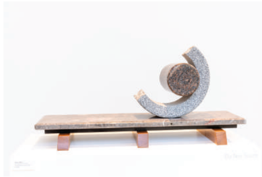
Shawn Morin Sacred Heart and the impossible solution , 2021 Granite