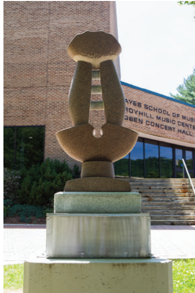
30th Rosen Sculpture Competition (2016 - 2017) Hybridized Daylily Granite, stainless steel