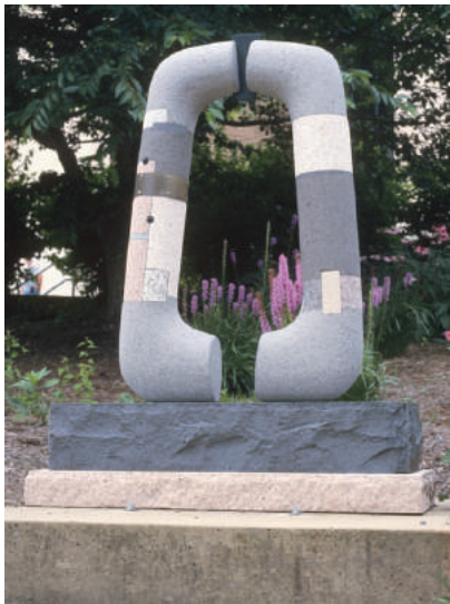
17th Rosen Sculpture Competition (2003 - 2004) Remnant Mixed granites and marble