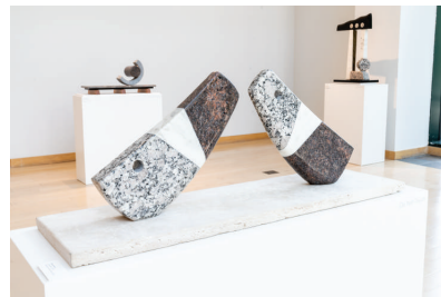
Shawn Morin Love Birds , 2021 Granite, marble, stone paint