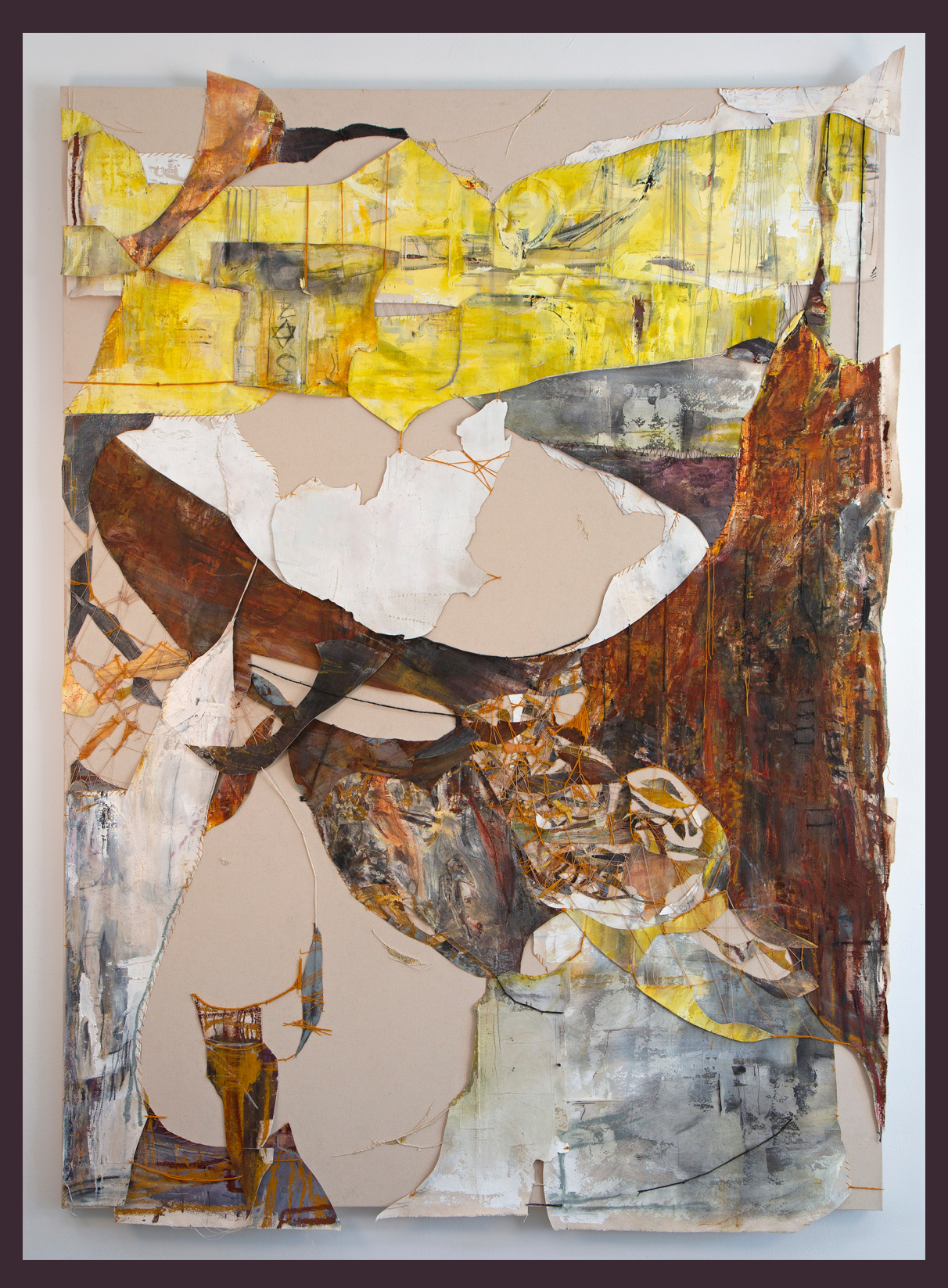
Tamar Segev Limanowskiego 48, Lodz, Poland, June 2, 2019, Number 5, 2021, Oil, graphite, pastel, thread, and canvas