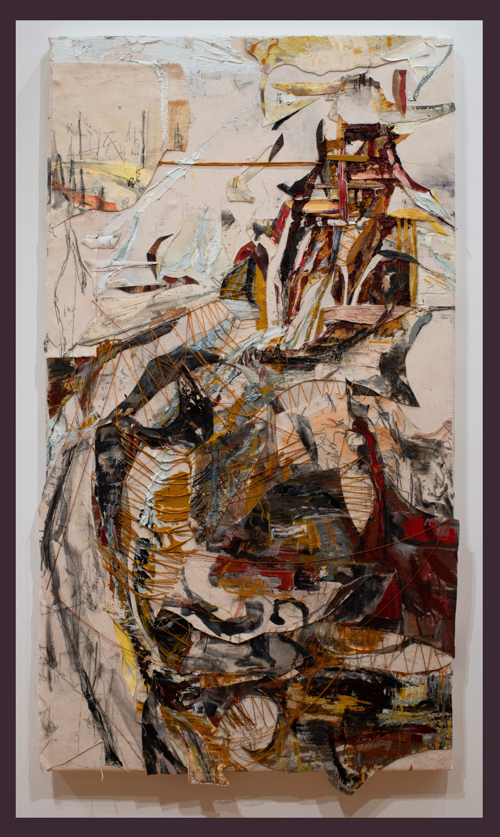
Tamar Segev Limanowskiego 48, Lodz, Poland, June 2, 2019, Number 2, 2020, Charcoal, graphite, pastel, oil, thread, and canvas