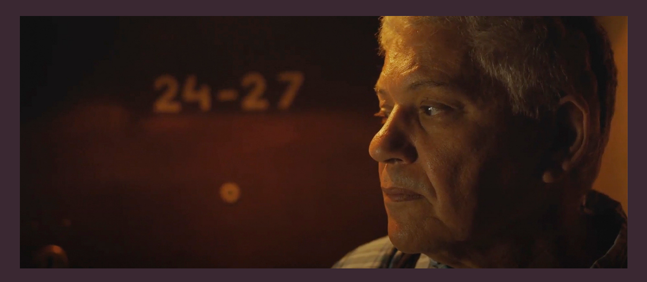
Ori Segev Film Stills from Looming in the Shadows of Lodz, 2024