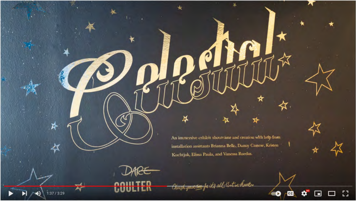
Celestial: Dare Coulter - Behind the Scenes

Click here to watch the "Celestial" installation process and gallery walkthrough video