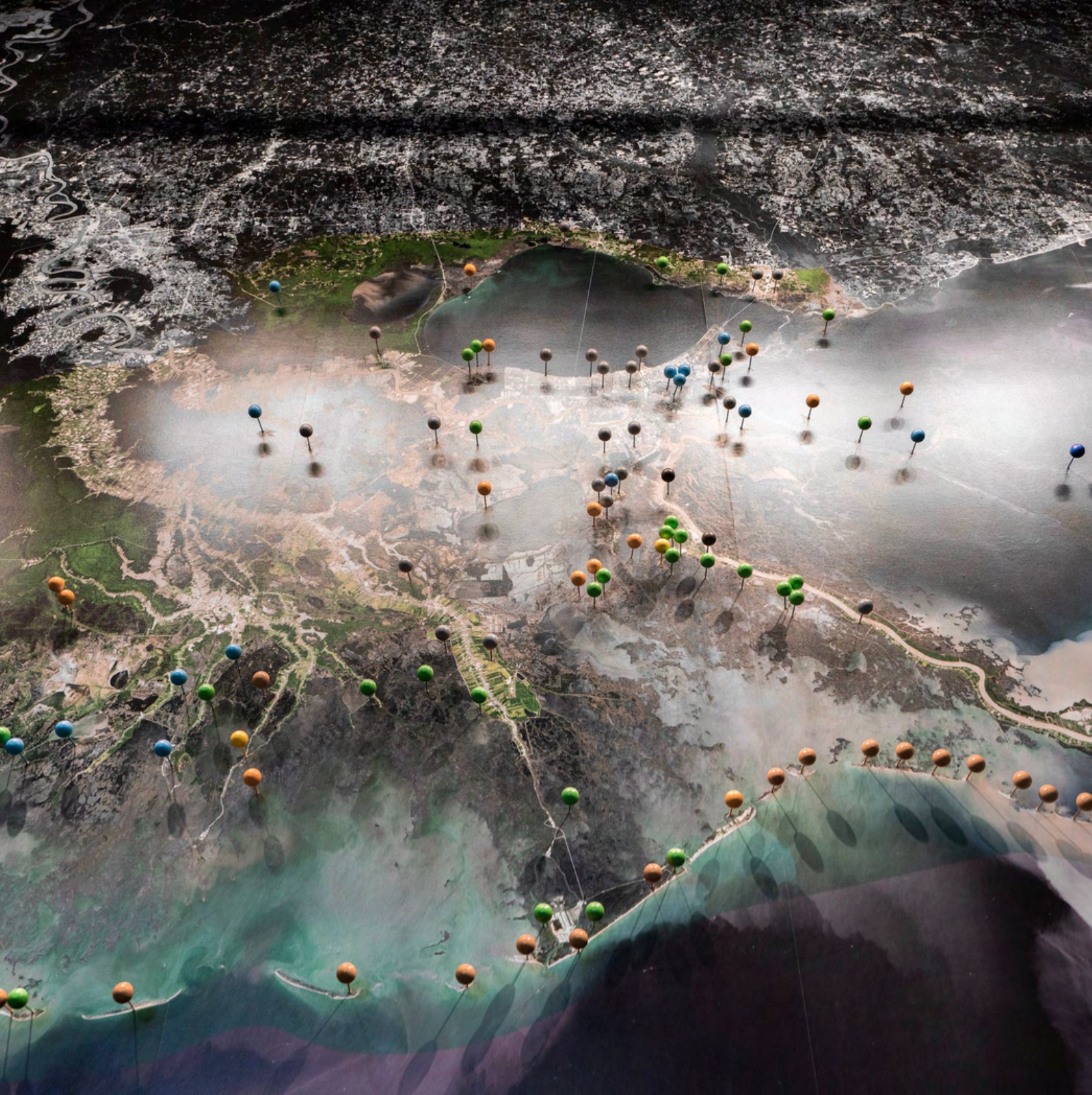
Leah Dyjak Stage IV, 2020