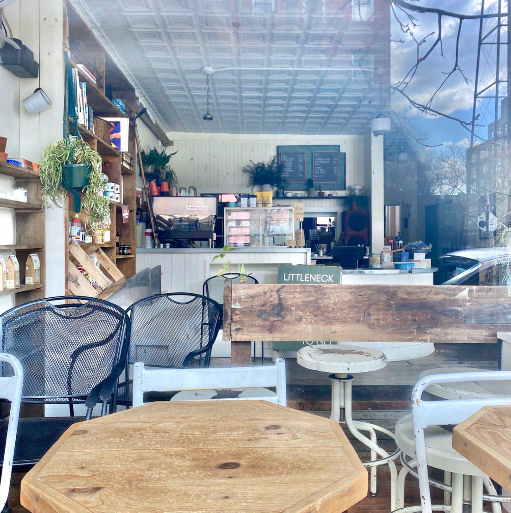
Lizzy Cross Littleneck Outpost, 2020