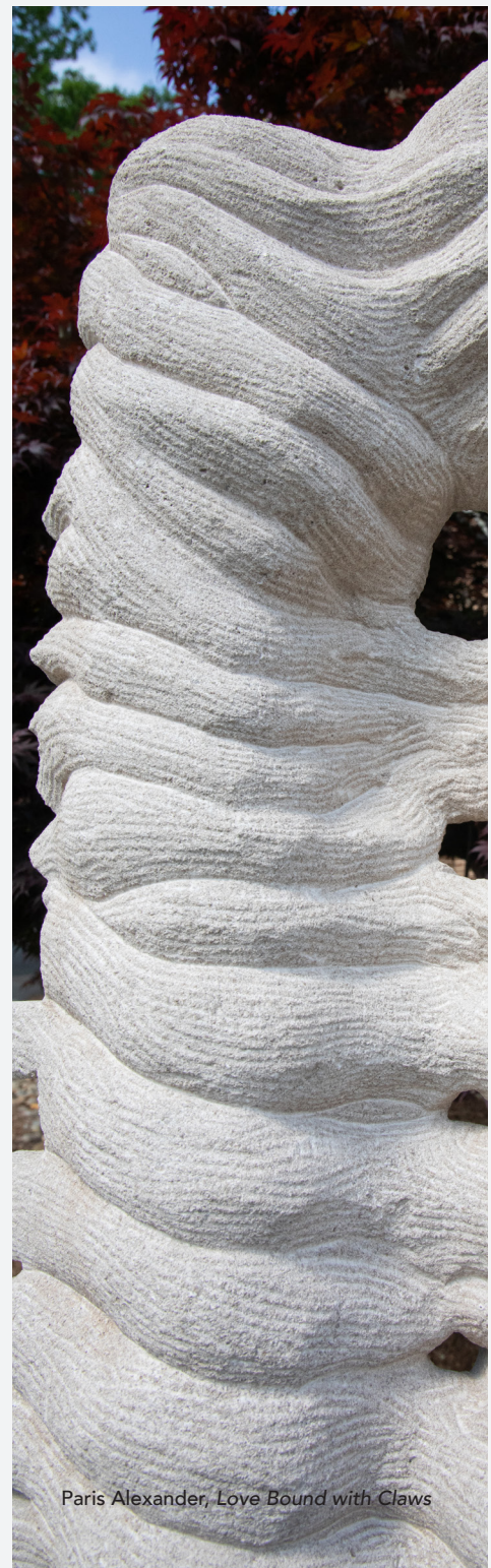
Paris Alexander, Love Bound with Claws

Free guided tours for classes and groups are available on a limited basis. Please contact the Turchin Center at turchincenter@appstate.edu or (828) 262-3017 to schedule a tour. All tours must be scheduled at least 2 weeks in advance.