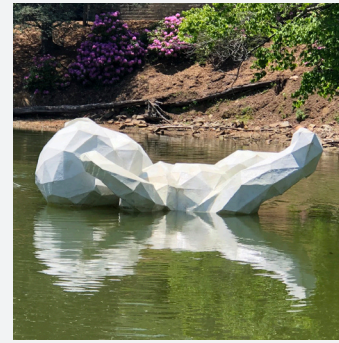
Kevin Curry (Tallahassee, FL) Lost and Found , 2019 Coroplast