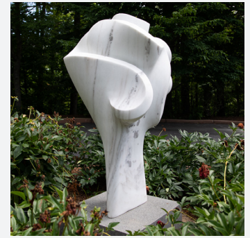
Susan Moffatt (Chapel Hill, NC) Sinuosity II , 2020 Marble on granite base Appalachian House*