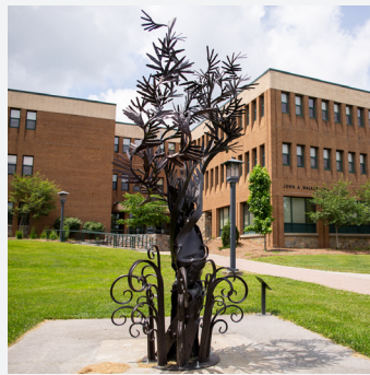
Kevin Eichner (Moncure, NC) Mei Amour , 2020 Reclaimed steel