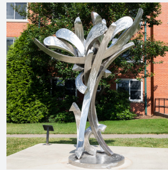
David Boyajian (New Fairfield, CT) Silver Sage , 2022 Stainless steel