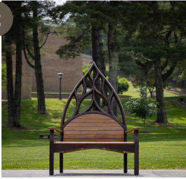
Beau Lyday (NC) The Long and Winding Road , 2022 Aged tin, wood, steel