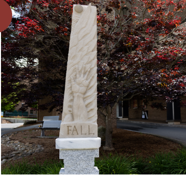
Paris Alexander (NC) The Rise and Fall of Icarus , 2020 Carved limestone, granite