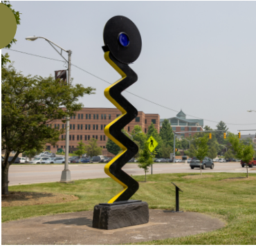
Glenn Zwegardt (NY) ZigZag Blues 03 , 2021 Painted Steel, cast glass, black granite