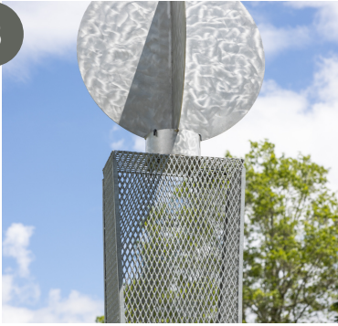
Carl Billingsley (NC) Sentinel , 2022 Galvanized steel, aluminum