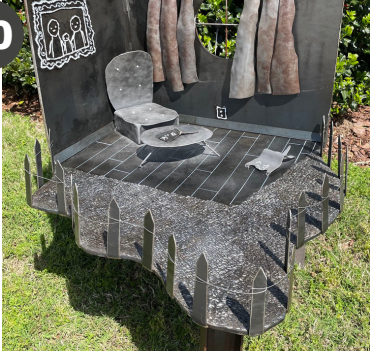
Sophia Dominici (NC) Room , 2022 Welded steel