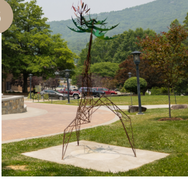
Wesley Stewart (GA) Space Flower , 2023 Painted and welded steel