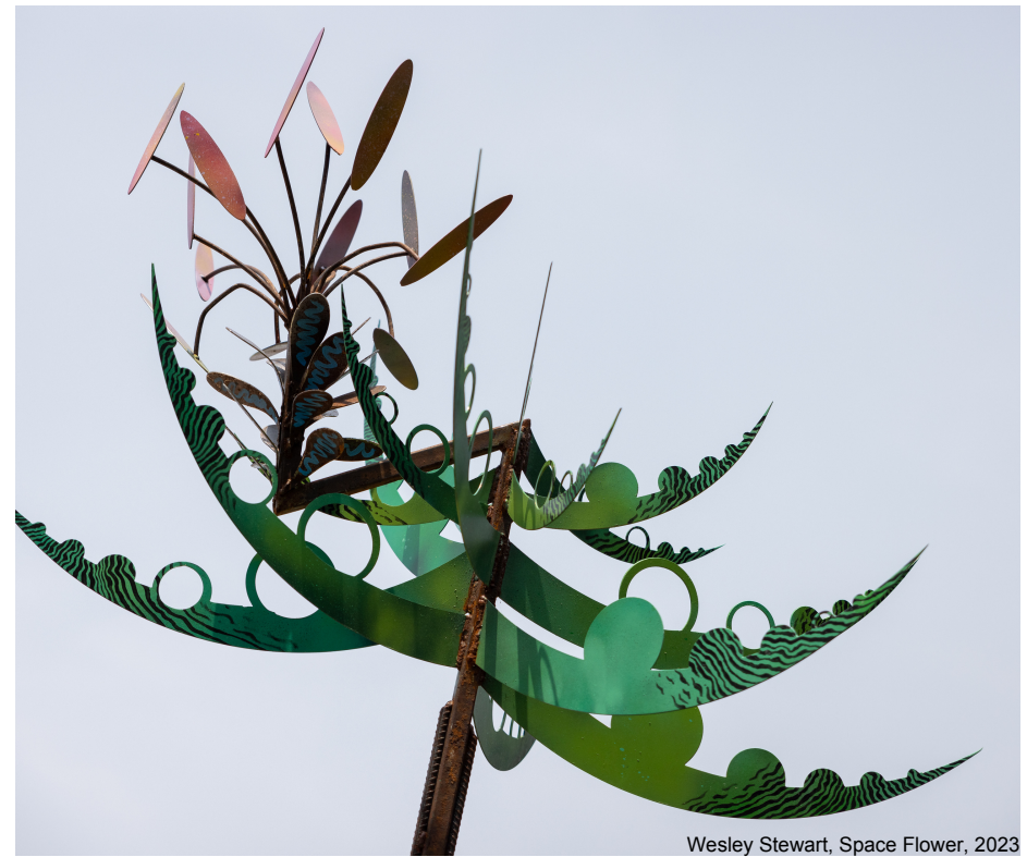
Wesley Stewart, Space Flower, 2023

Free guided tours for classes and groups are available upon request. Please contact the Turchin Center at turchincenter@appstate.edu or (828) 262-3017 to schedule a tour.