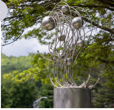
Adam Walls (NC) Maman , 2020 Stainless steel