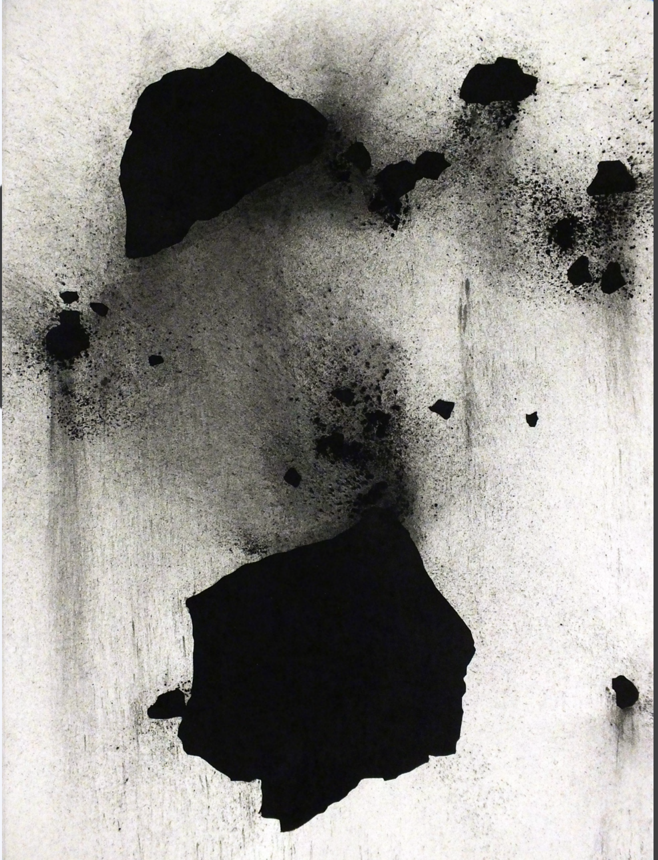
Kathleen Thum Acrid , 2019 Charcoal on Paper