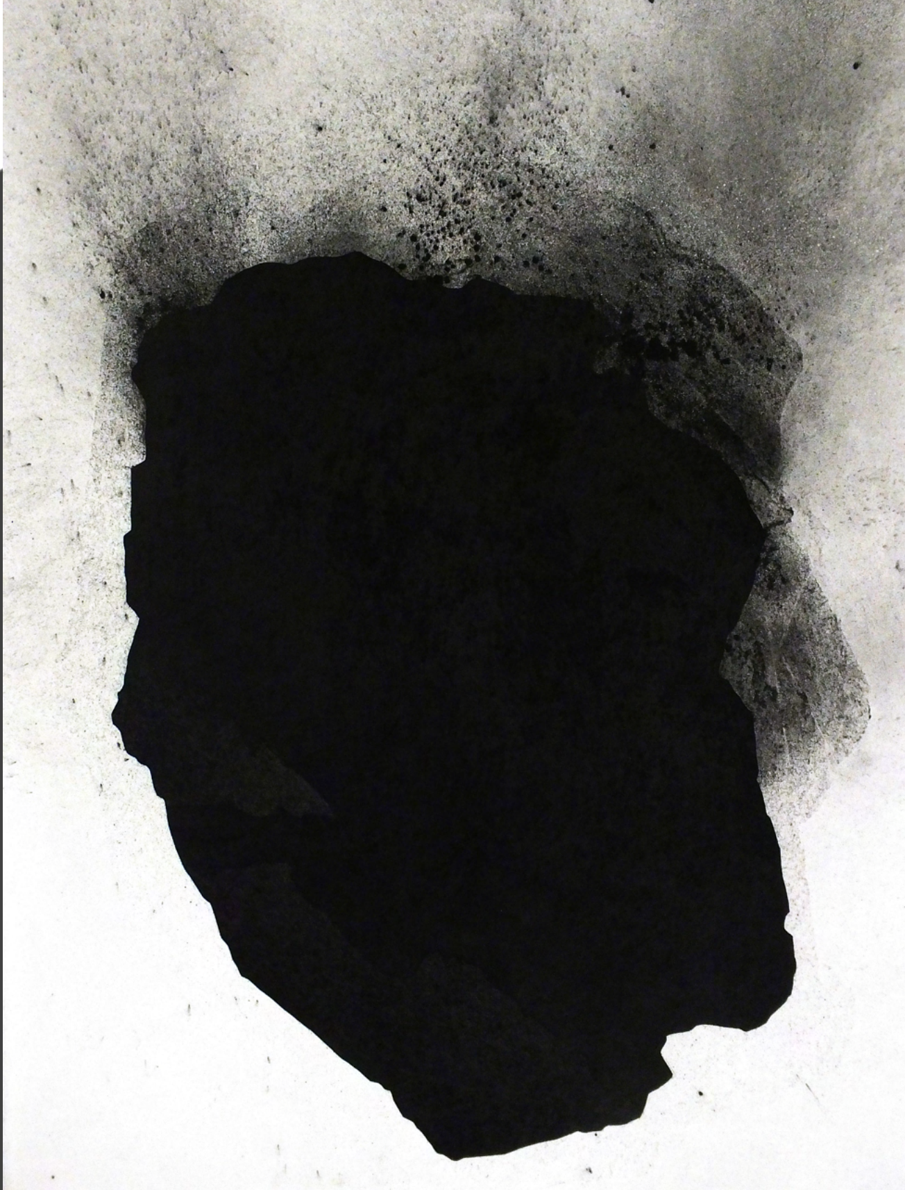
Kathleen Thum Combustible Rock , 2019 Charcoal on Paper