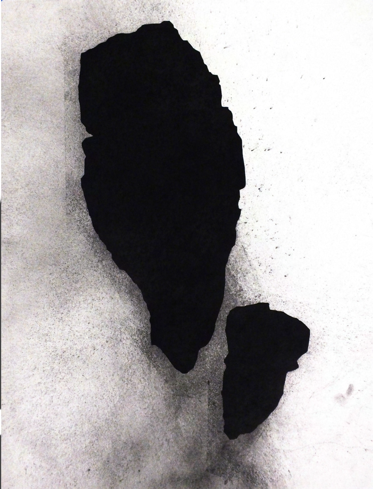
Kathleen Thum Coal Haze , 2019 Charcoal on Paper